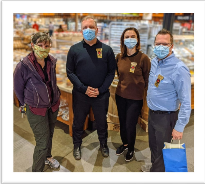
Children's Rides Sponsor Chantilly Wegmans

Sponsors receive premium placement in Centreville Day's Marketplace and a priceless opportunity to show their leadership and support of community in the Centreville-Chantilly area.