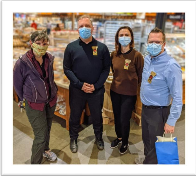
Children's Rides Sponsor Chantilly Wegmans