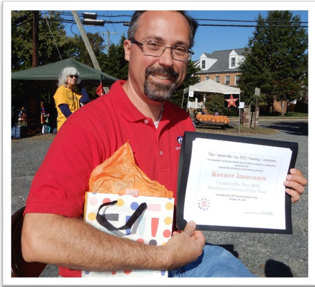
Business Citizen of the Year 2022, Keener Insurance

THE CENTREVILLE COMMUNITY : Settled in the mid-18 th century and originally known as Newgate, Centreville was chartered in 1792. The town was famously fortified and occupied by Confederate and Union forces during the Civil War. Historic Centreville Park includes a significant portion of the original town and is situated within the Centreville Historic District. The park features Mount Gilead, built as Federal era tavern (circa 1785), fortifications and earthworks built in the Civil War, and a Sears Catalogue House (1934). Ten additional buildings, dating from 1796 to the 1950s, are included in the Historic District, which is the largest of its kind in Fairfax County.