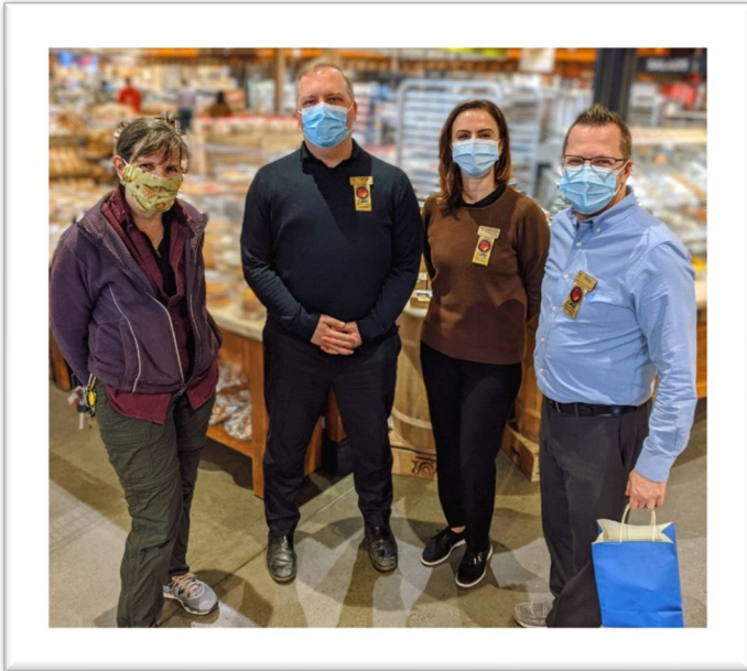
Children's Rides Sponsor Chantilly Wegmans